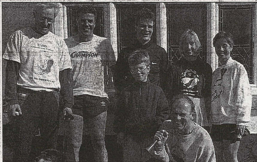
● Families take part in the Kennet Valley Hash House Harriers event at Ramsbury

ALTHOUGH a little short on numbers due to the Countryside March the inaugural Kennet Valley Hash House Harriers event at Ramsbury on Sunday was a great success.