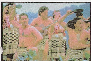
The Savernake Forest Hash party

really start in the pub - champers and a remarkably fine buffet laid on in a separate room - all for a mere £6.00 a head. Please let Val know if you will be participating - and stump up in advance.