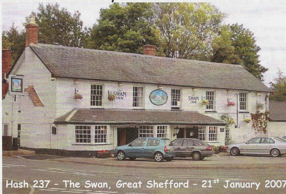
Hash 237 - The Swan, Great Shefford - 21 st January 2007